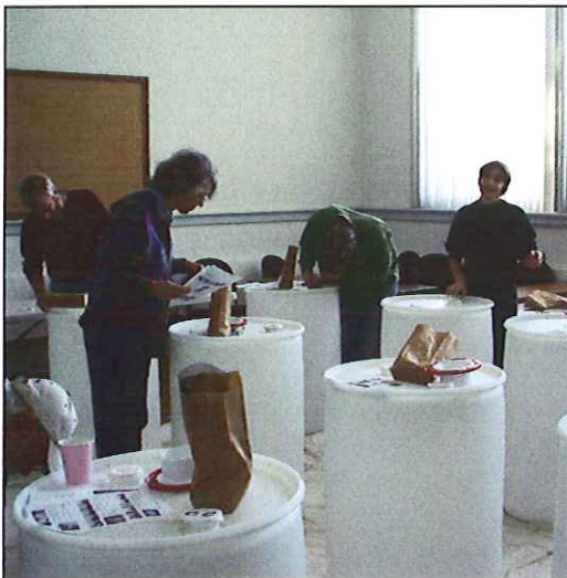
The first workshop was held by the SCWA in February 2007.